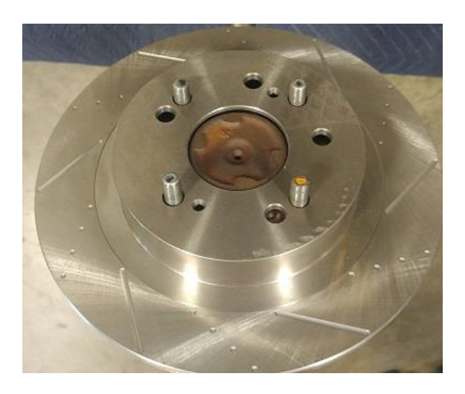
Slide the rotor over the wheel flange.