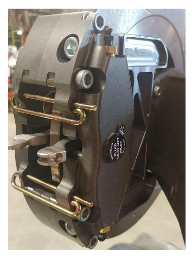
Slide the caliper over the rotor and install the two 3/8 shank bolts through the caliper and into the bracket and tighten to 35 ft/lbs.