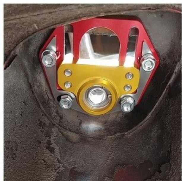
Underside of how template/washer needs to be installed