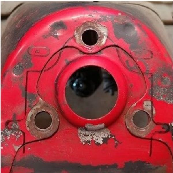
After marking strut tower for cutting/drilling