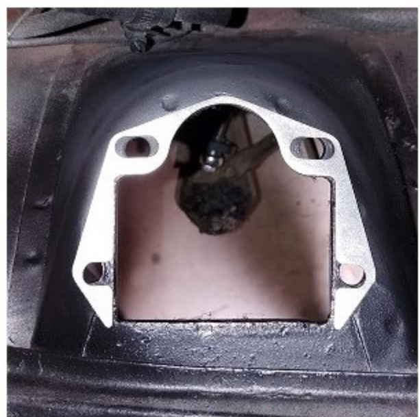
Comparison of template and cut out