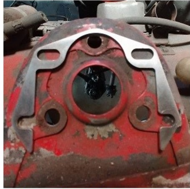
Align and mark strut top using template/washer included with camber plates