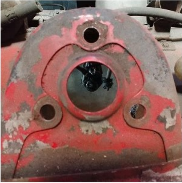
Unmodified factory strut tower