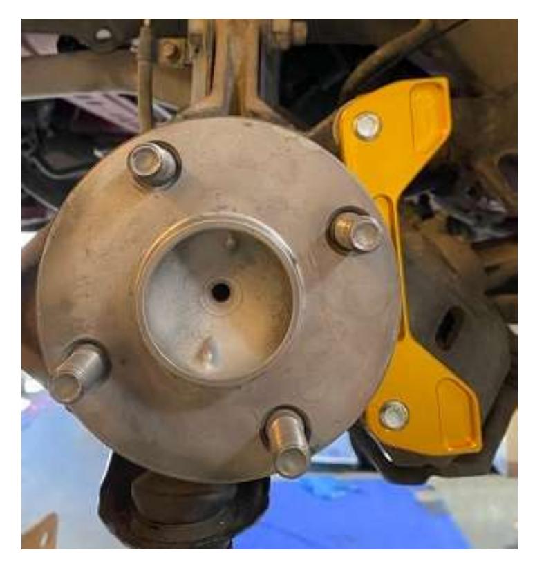
Install the as shown using the two 12-1.25x30mm bolts and lock washers. Torque to 60ft/lbs.